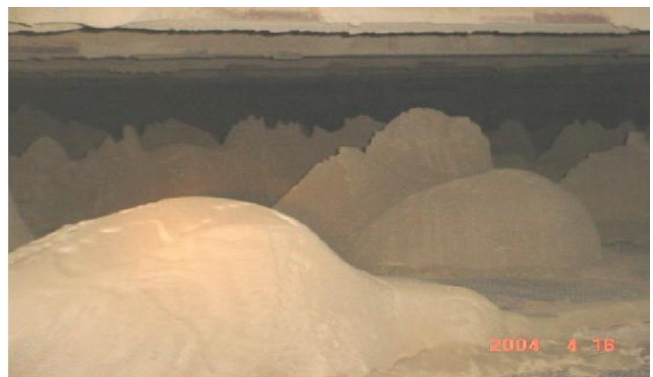
Figure 1. Ashes deposits on SCR catalyst surface

The de-NO x technologies are lagging behind the current and future environmental and legislative demands. The current SCR systems suffer from several inherent technological and